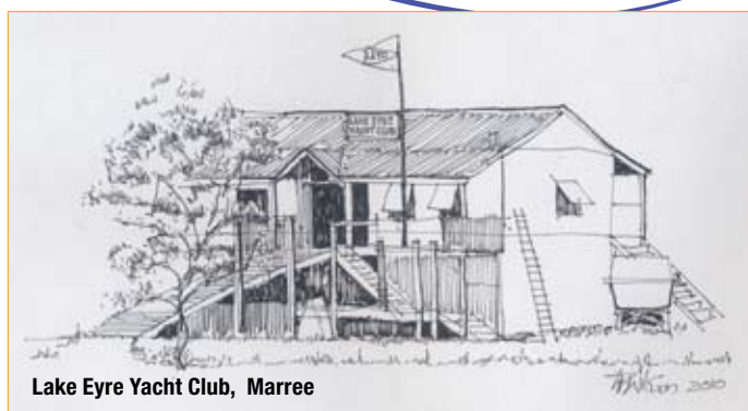
Lake Eyre Yacht Club, Marree

At the first opportunity I went in and introduced myself as the chairman of the Decor Committee at Manly Yacht Club. "Ah" said the man in charge "what colour would you paint the walls?" indicating the bare fibro of the interior. Before I could answer he said "It doesn't matter anyway. We go out at the Council Clear Out and collect all the old paint tins with some left in.