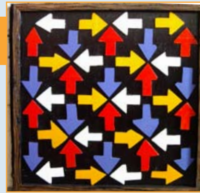
'Broken Light Over The Dark Void'.