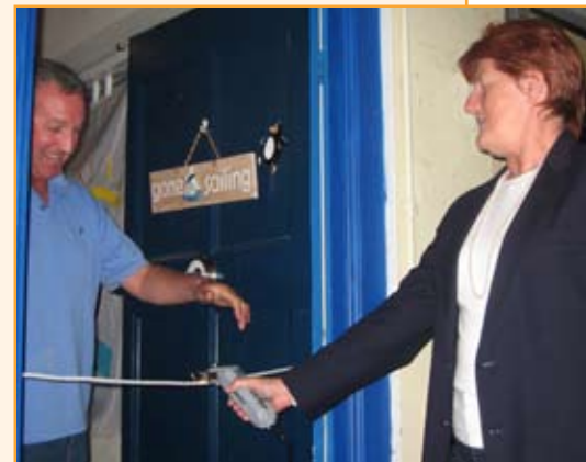
Maz cut the rope with a hot knife - very sailing!!!